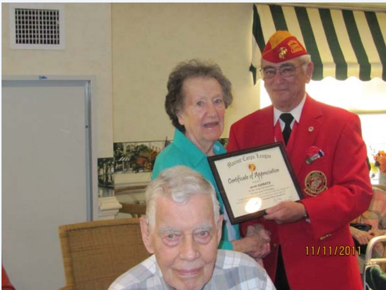
Veterans Day visit to Highgate Assisted Living