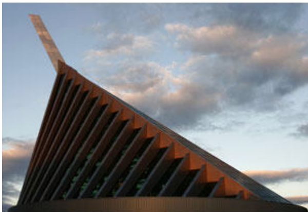
Marine Corps Museum

Next Meeting June 7, 2010 *1800 hours (*Spring Dinner & Scholarships) Knights of Columbus 327 N. Newtown Street Rd. (Route 252) Newtown Square, PA 19073