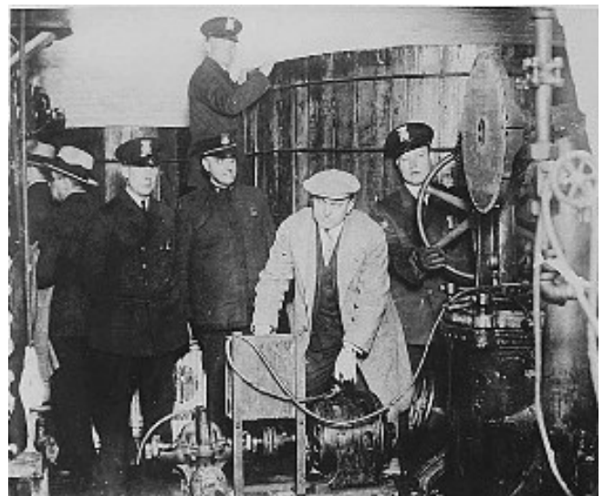
Detroit police inspecting equipment found in a clandestine underground brewery during Prohibition era