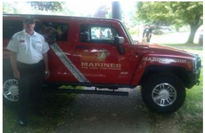
Today's Marines sure know how to ride in style!!!